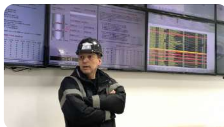
Manager and employee