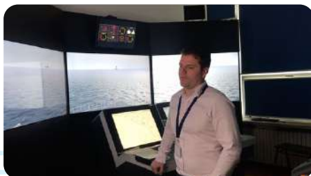
Trainer and employer