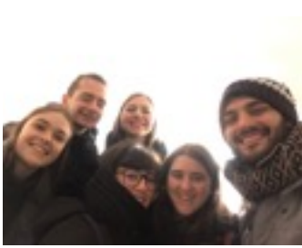
With our Argentinian friend met at Brand Castle.