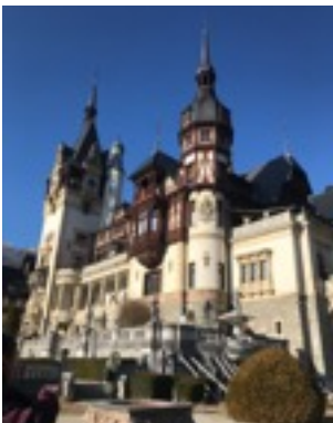
The Peles Castle, Siania.

After going home for the Christmas break, we came back in Romania with more energy (and full stomachs). We knew we would be there for only 2 more months and that time would fly. Therefore we decided to enjoy every moment we'd spend with each other and took all our days off left to organise a one-week trip in Romania to discover more about the country we've been living in for 3 months already.