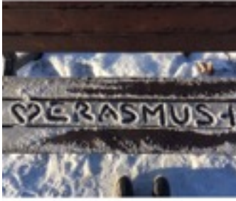
Writing in the snow in Brasov.